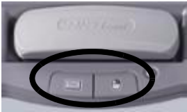
Pen tray buttons

The pen tray has at least two pen-tray buttons. One button is used to launch the On-Screen Keyboard. The second button is used to make your next touch on the interactive whiteboard a right-click. Some interactive whiteboards have a third button; this button is used to quickly access the Help Center.